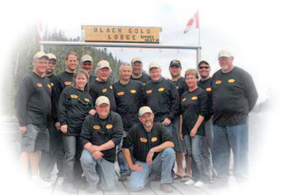
Boddington Tournament - Class of 2010

BRITISH COLUMBIA SALMON FISHING – Your Tournament Host, Black Gold Lodge, will donate four – standard package trips for ONE person each. Prizes to be for our Friday – Monday trips for the 2012 season (space available). We have operated our Lodge in Rivers Inlet for 23 years and have been growing steadily. This can only happen by offering quality service and equipment. Rivers Inlet is world renowned for it's huge Chinook Salmon, in fact the world record Chinook was caught off the mouth of the inlet. During work on the hatchery programs in the fall of each year, Chinook of 100 lbs. plus are regularly found in the river systems. This along with over-sized Coho Salmon entering the Inlet each summer puts Rivers Inlet in a class all it's own. All other pacific salmon and the usual assortment of bottom fish – Halibut, Ling cod etc. are available as well. Situated on the rugged central coast of B.C. it is a haven for all the marine mammals. Jim Rough along with his wife Brenda and son Michael will be your hosts for these donated fishing trips.